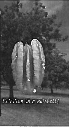
Nutrition in a nutshell!