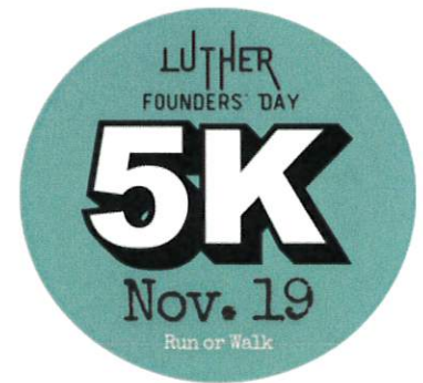
NEED RUNNERS & WALKERS