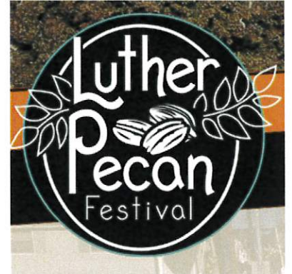
Nov 18 - 19