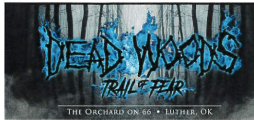
Dead Woods Trail of Fear Orchard on 66

20100 NE 178, Luther OK, Luther, OK, YOUTUBE: https://www.youtube.com/watch?v=GwbsmoYOXZ8 hauntedoverdrive.com