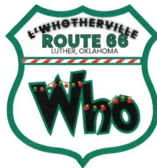
LIGHTING 5 PM, NOV 18