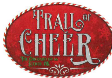
Weekends in December