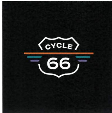
Sun, Nov 5, rest stop downtown for the 66-mile ride!